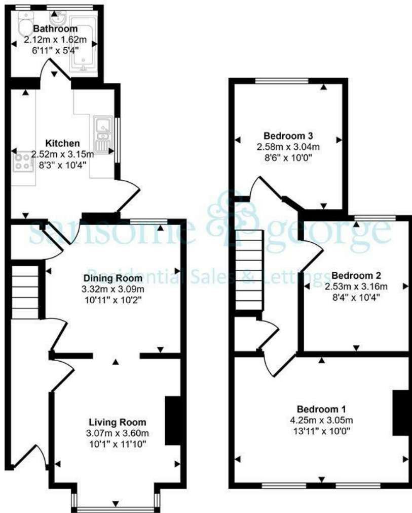
Ground Floor Approx 39 sq m / 421 sq ft

Approx Gross Internal Area 75 sq m / 803 sq ft