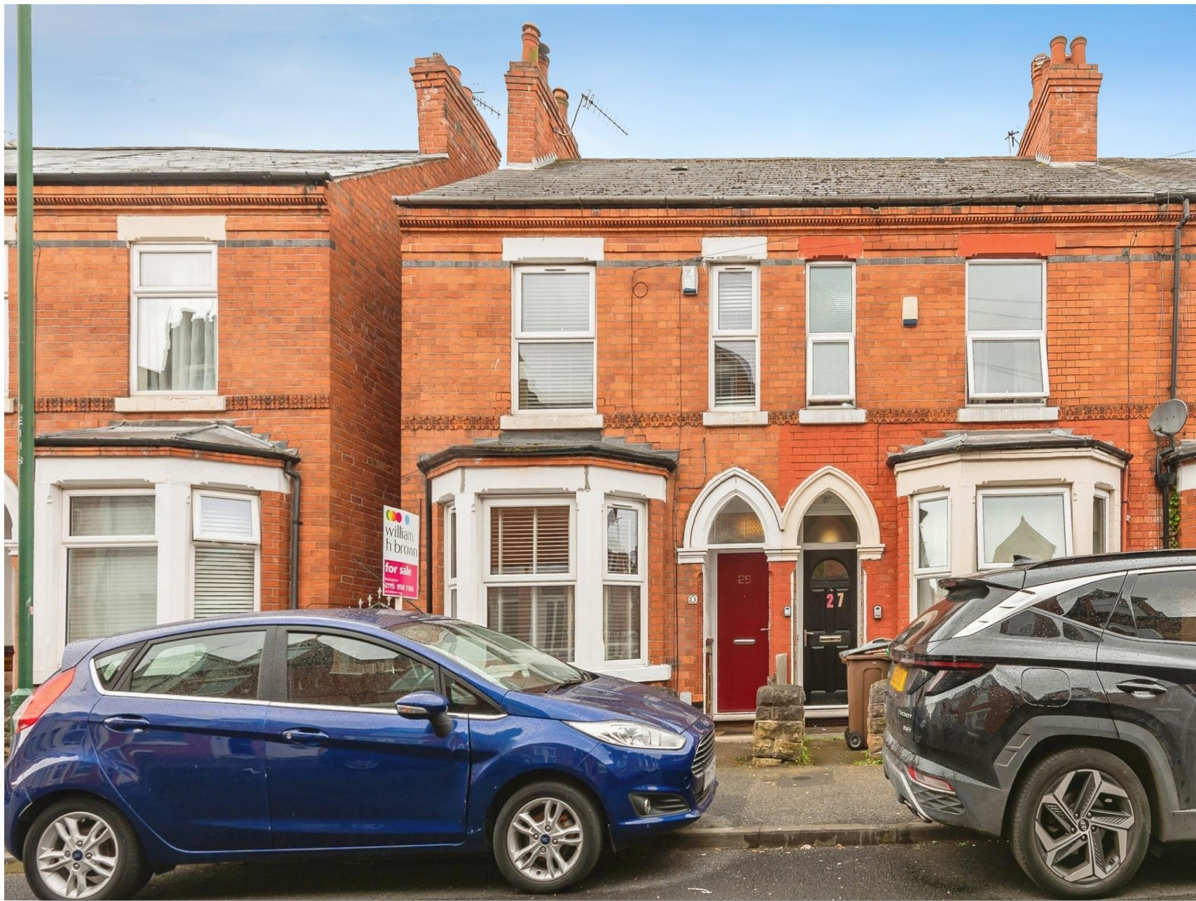
Exeter Road, Nottingham NG7 6LP