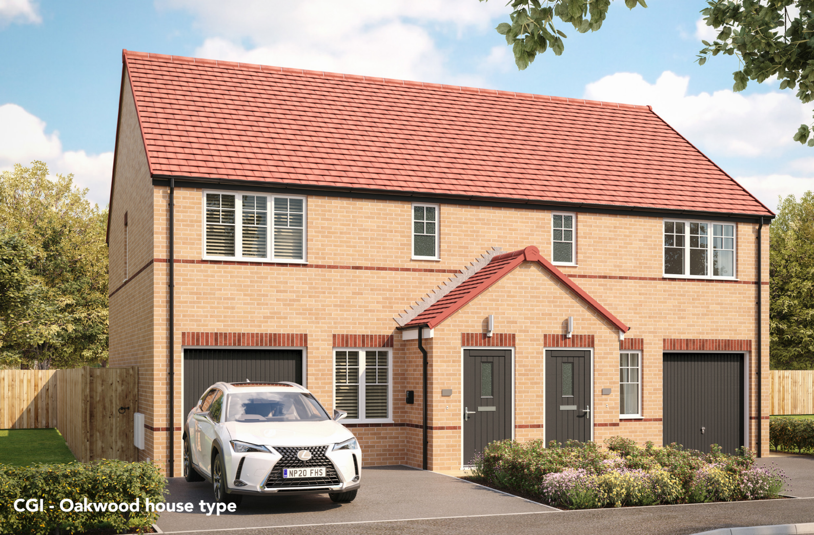
CGI - Oakwood house type