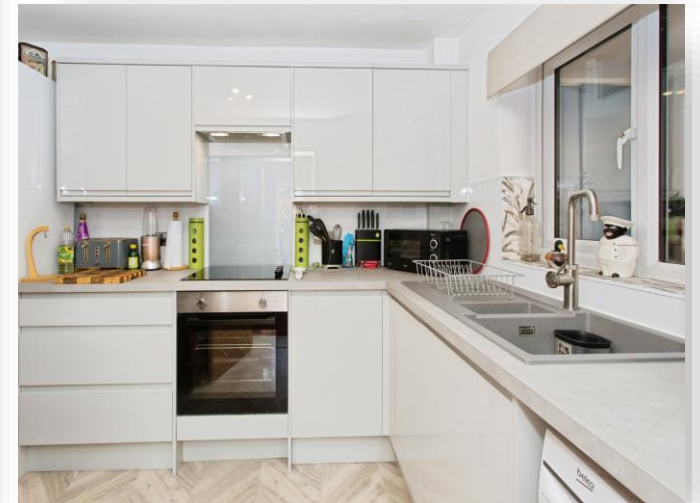
St. Georges Way, Impington, Cambridge, CB24 9AF