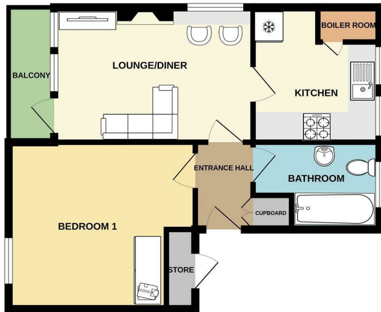
FIRST FLOOR FLAT

Whilst every attempt has been made to ensure the accuracy of the floorplan contained here, measurements of doors, windows, rooms and any other items are approximate and no responsibility is taken for any error, omission or mis-statement. This plan is for illustrative purposes only and should be used as such by any prospective purchaser. The services, systems and appliances shown have not been tested and no guarantee as to their operability or efficiency can be given. Made with Metropix 12/2026