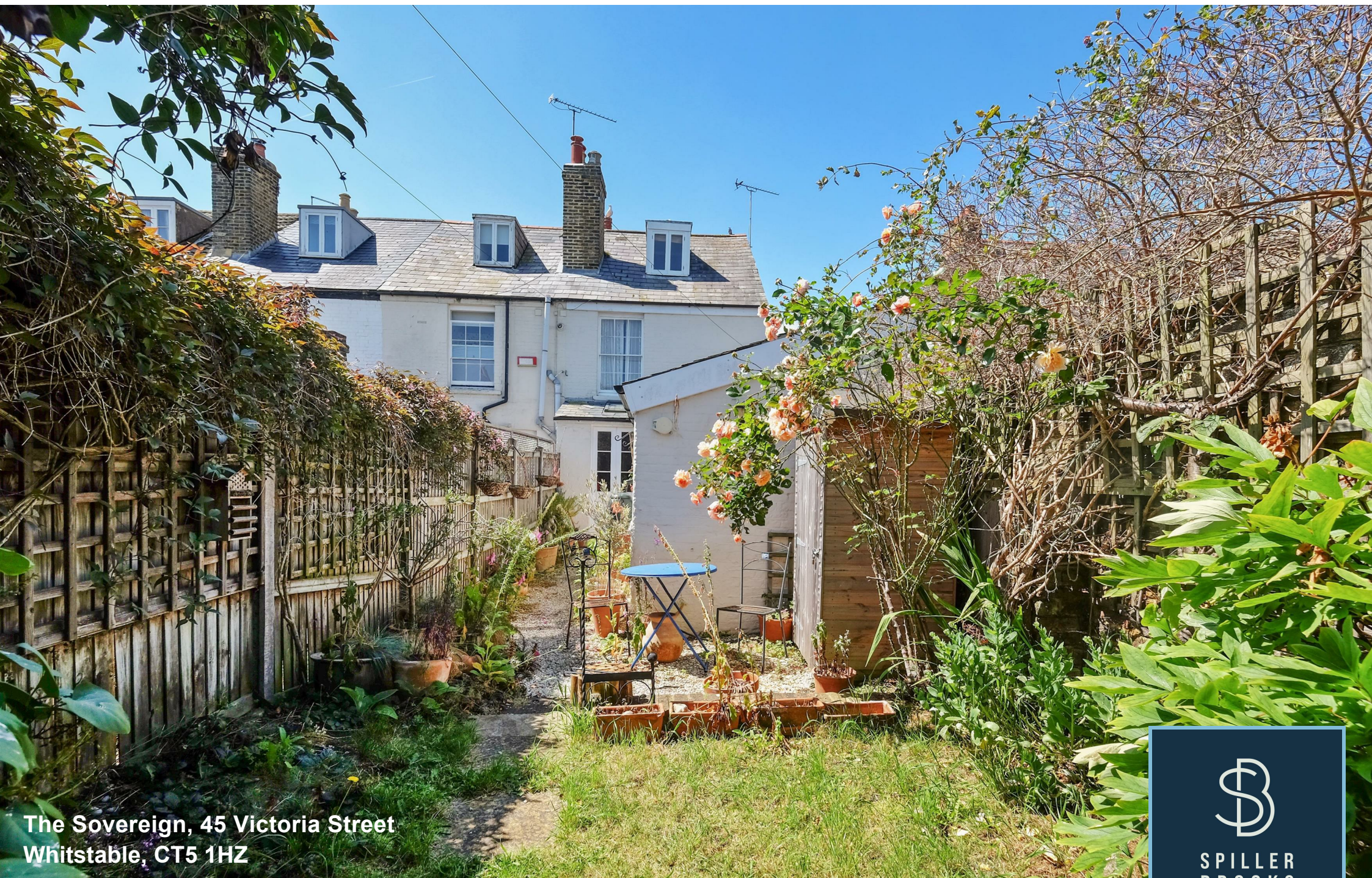
The Sovereign, 45 Victoria Street Whitstable, CT5 1HZ