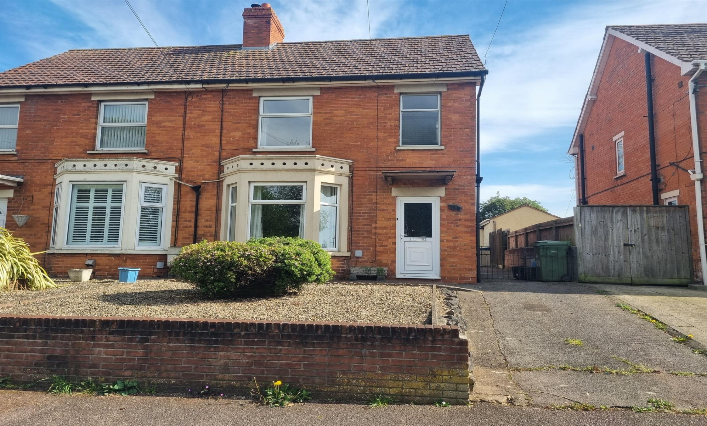
Priory Avenue, Taunton TA1 1YB