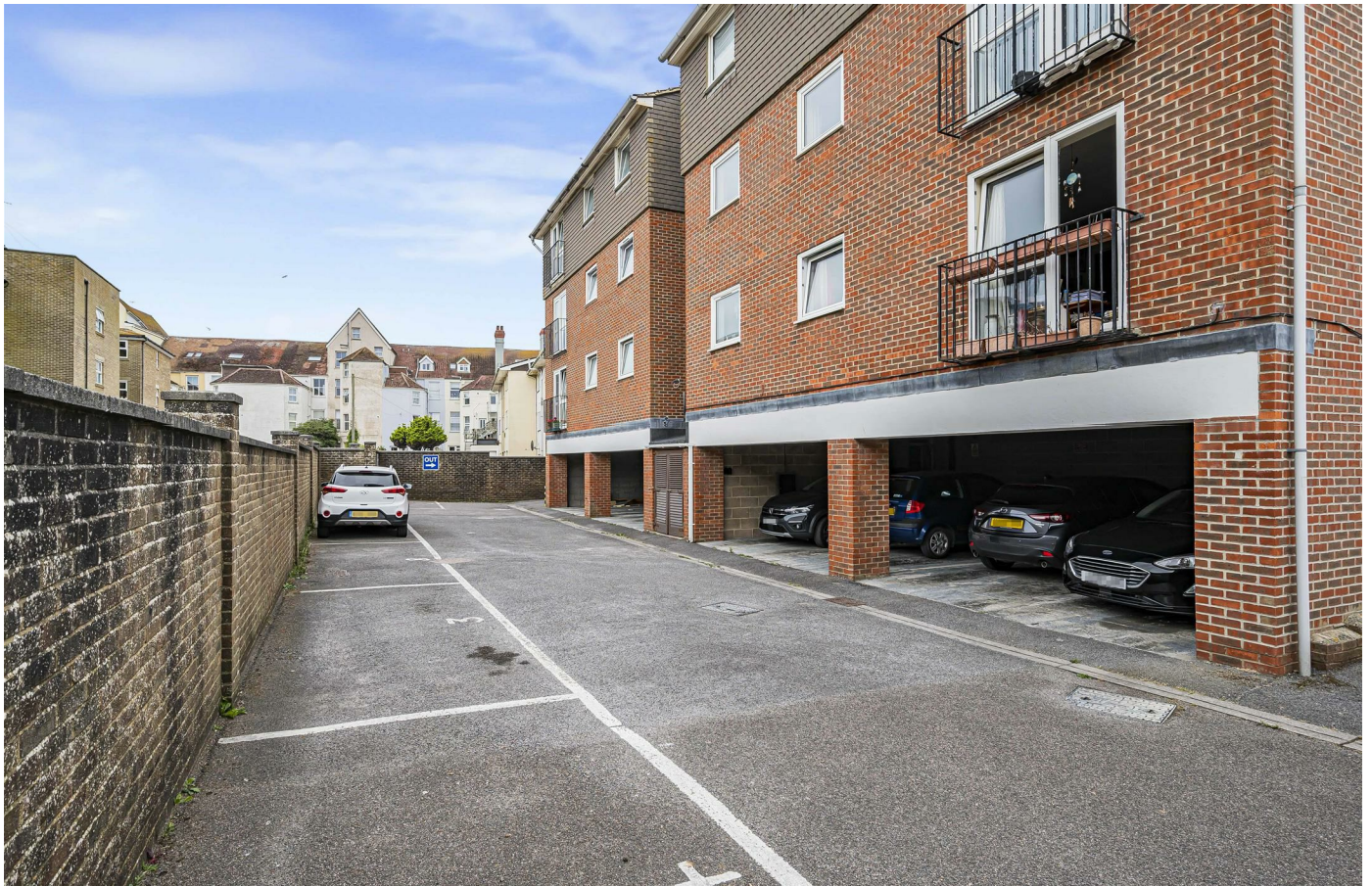
Flat 7 Rayford Court 14 St. Johns Road, Seaford, BN25 1JW