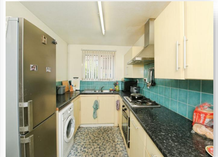
Gostwick, Orton Brimbles PETERBOROUGH PE2 5XG