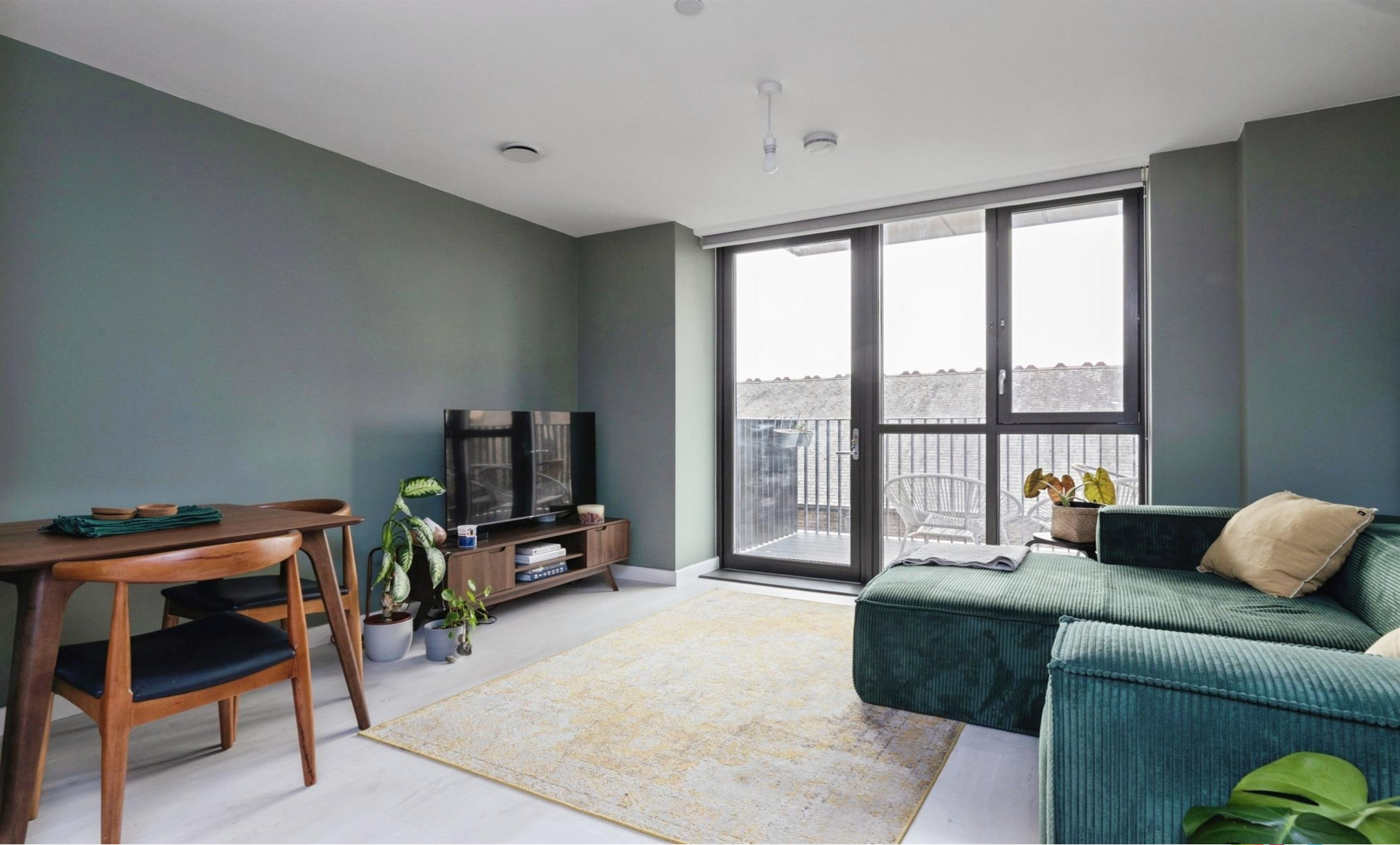
Challingsworth House, Linton Road, Barking, IG11 8TL