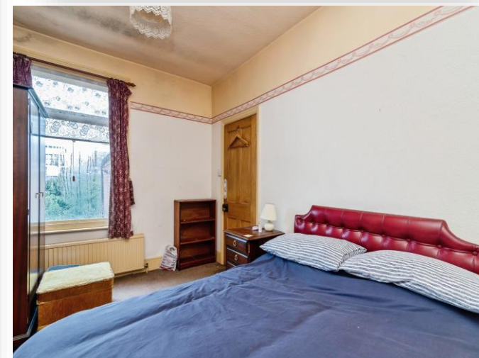
Fleeman Grove, West Bridgford Nottingham NG2 5BH