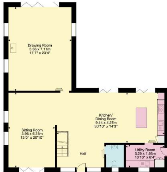
Ground Floor Main House