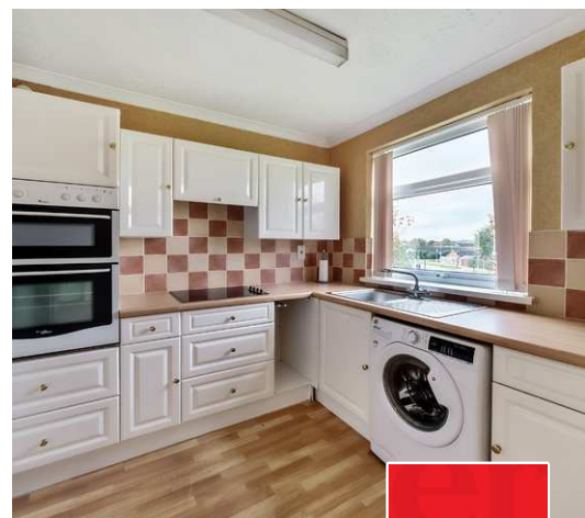
Flat 5, Haseley Court Ferndown Close, Taunton TA1 4TL