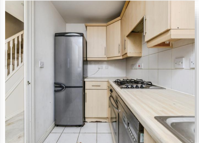
Sharnbrook Avenue, Hampton Vale Peterborough PE7 8LR