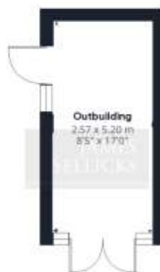
Floor 1 Building 2