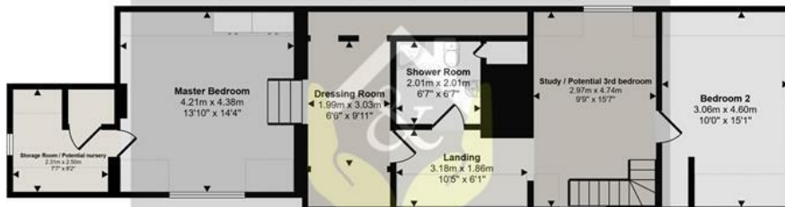
First Floor Approx 81 sq m / 868 sq ft