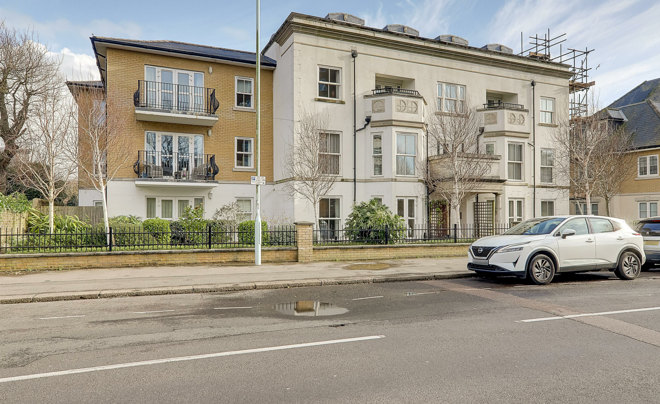
Flat 1a Wyresdale House, 90 Heene Road, Worthing, BN11 3RE Price £260,000