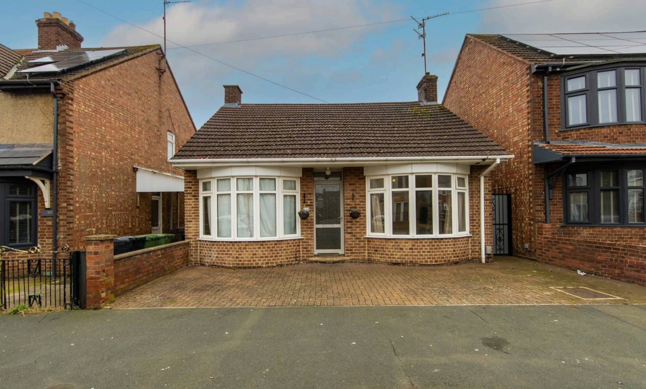
Peveril Road, Peterborough, PE1 £220,000