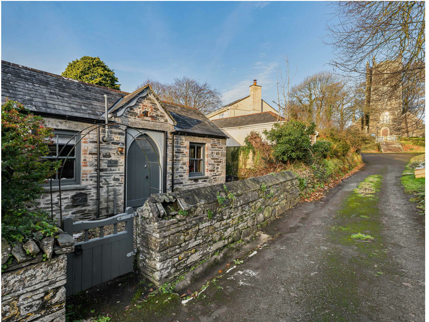
The Old School