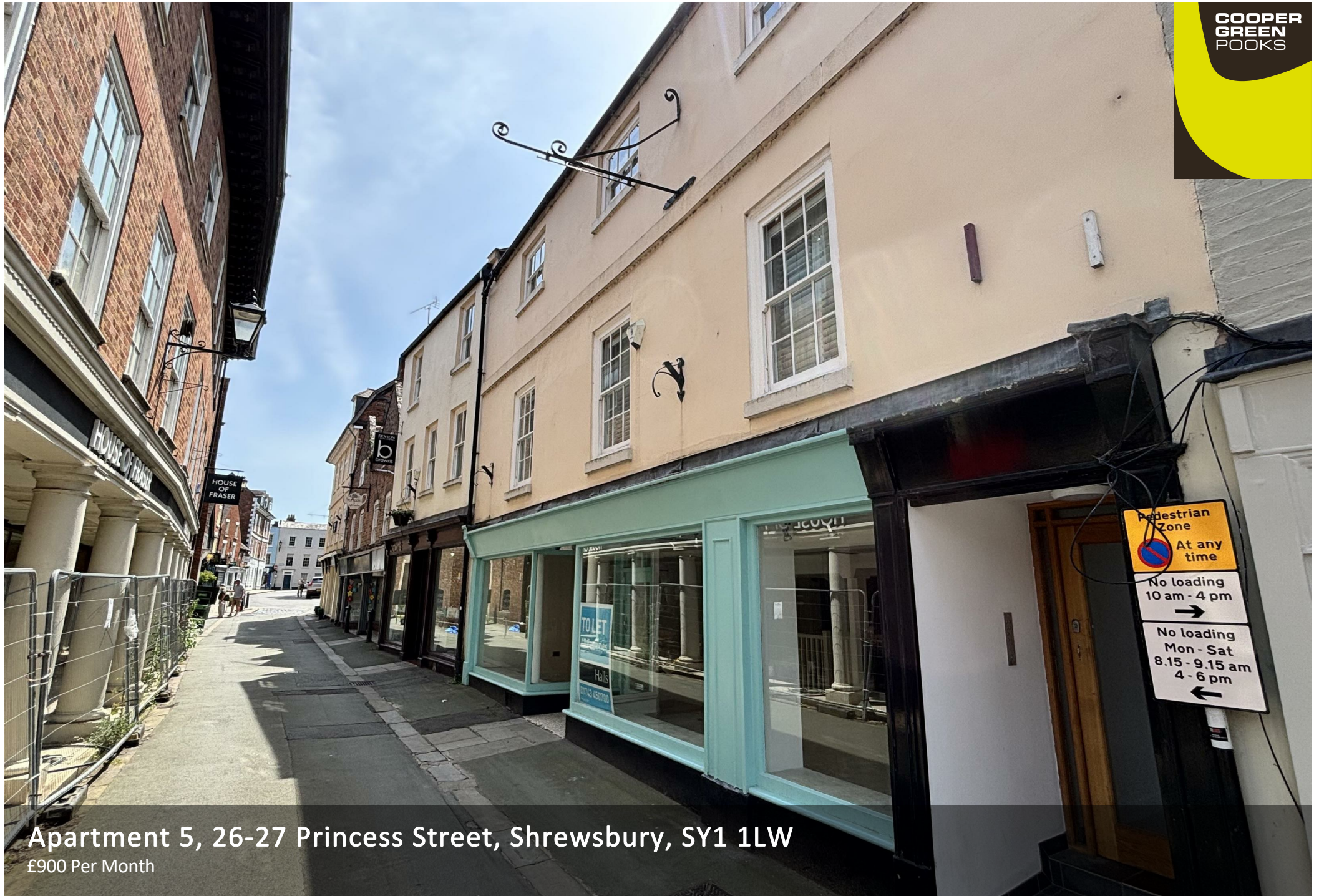
Apartment 5, 26-27 Princess Street, Shrewsbury, SY1 1LW £900 Per Month