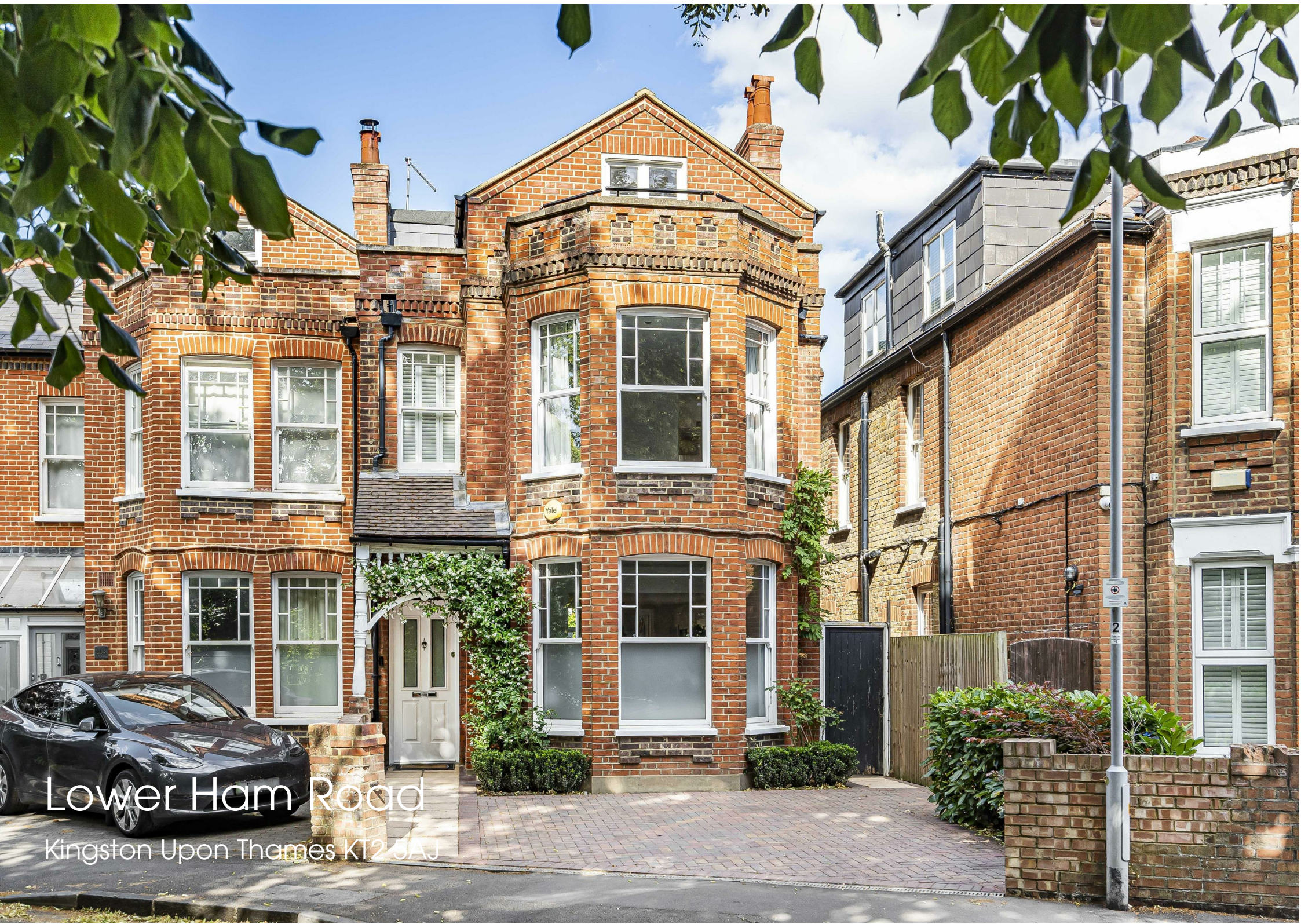
Lower Ham Road Kingston Upon Thames KT2 5AJ