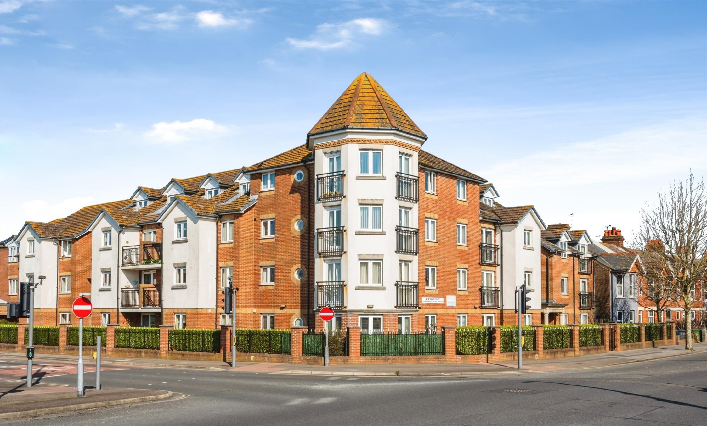
St. Aidans Court Whitley Road, EASTBOURNE BN22 8NW