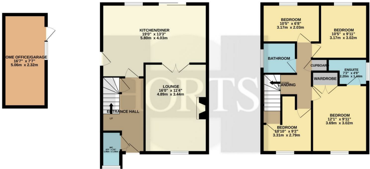
TOTAL FLOOR AREA: 1147 sq.ft. (106.6 sq.m.) approx.

Whilst every attempt has been made to ensure the accuracy of the floorplan contained here, measurements of doors, windows, rooms and any other items are approximate and no responsibility is taken for any error, omission or mis-statement. This plan is for illustrative purposes only and should be used as such by any prospective purchaser. The services, systems and appliances shown have not been tested and no guarantee as to their operability or efficiency can be given. Made with Metropix ©2026