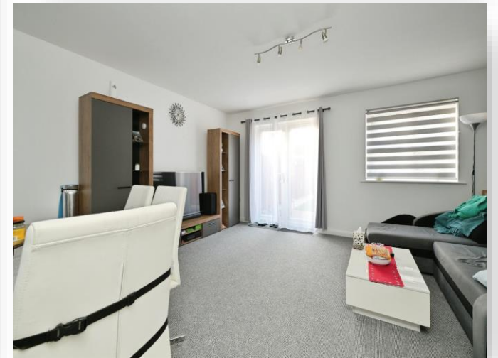
Fenmen Place, Wisbech, PE13 3FA