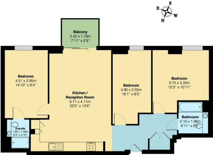
Third Floor Total Area: 87.3 m 2 ... 940 ft 2 (excluding balcony) All measurements are approximate and for display purposes only.