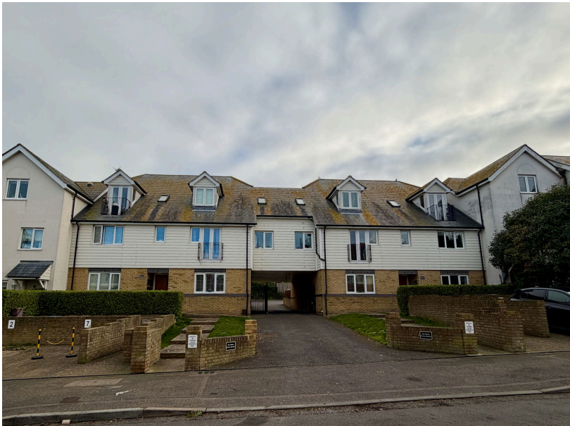
12 The Gates, Percy Avenue, Kingsgate

Key features include - allocated private parking space, a stunning large front-to-back open-plan living and kitchen room with balcony to front and windows to rear, a large main bathroom & master bedroom en-suite. The beach is at the bottom of the road, approx 900m from the front entrance and this section of the coast line boasts some beautiful walks and bays.