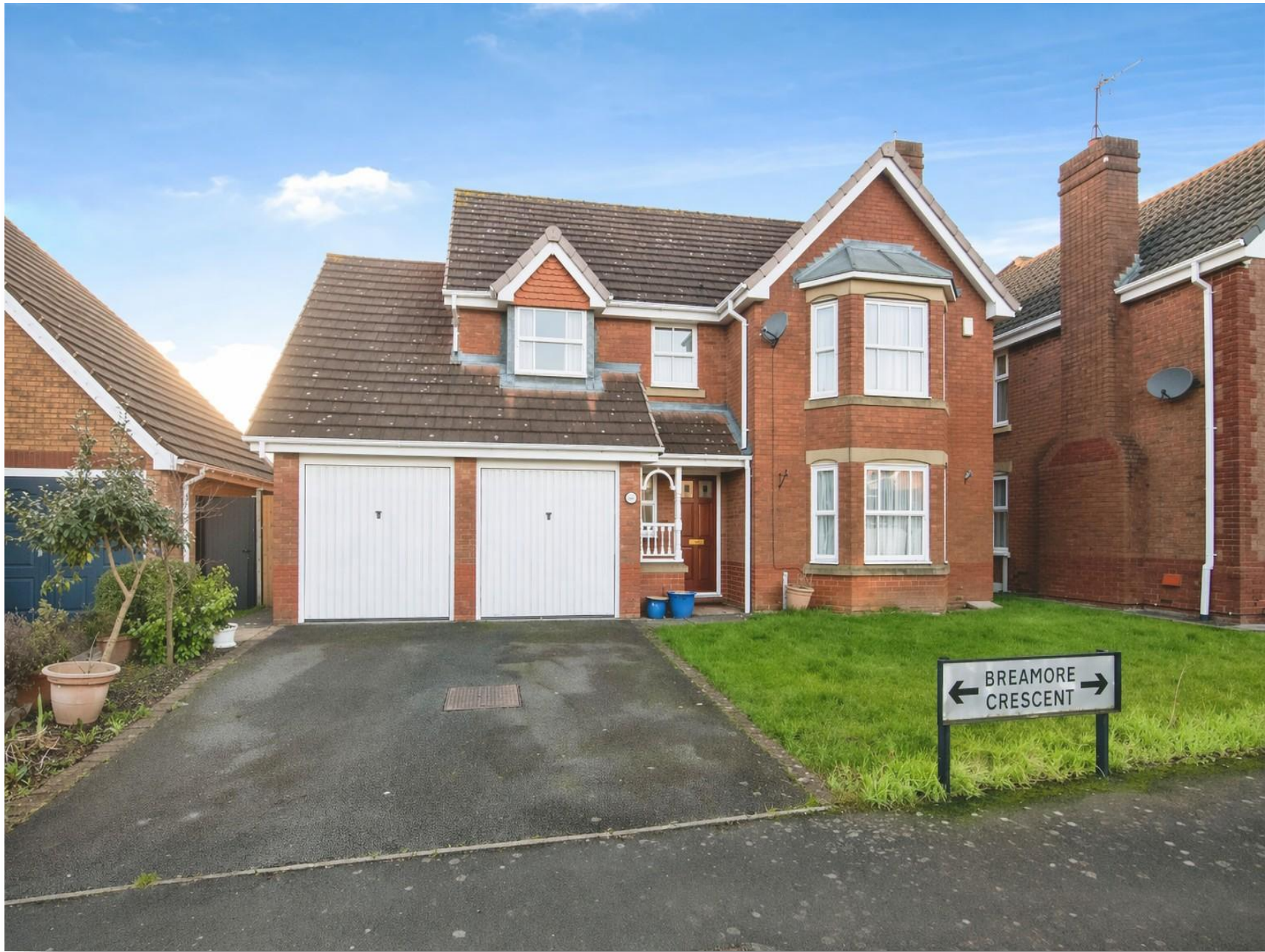
Breamore Crescent, Dudley DY1 3DA