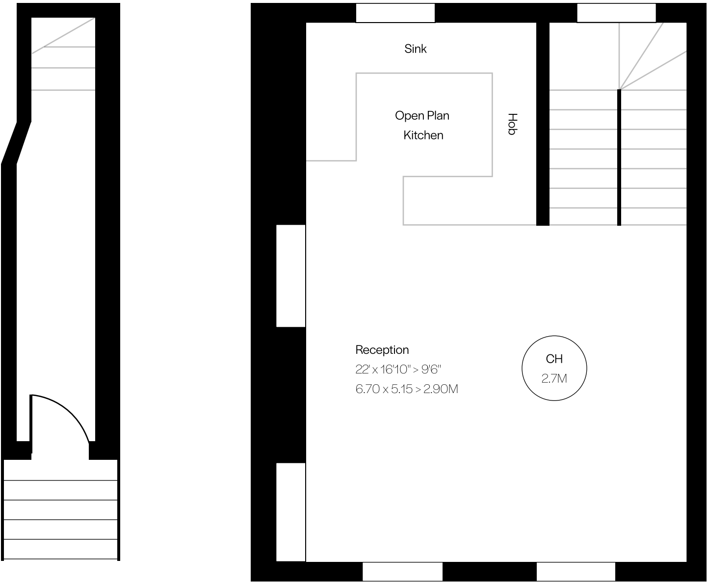
First Floor 360 SQFT