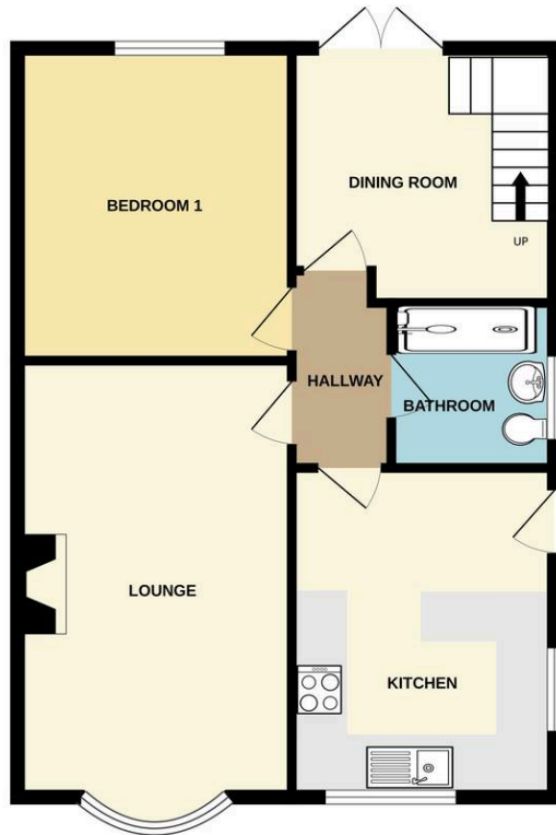
GROUND FLOOR 637 sq.ft. (59.2 sq.m.) approx.