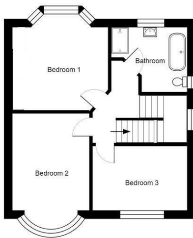
Second Floor Area: approx 33.3 m 2 ... 359 ft 2