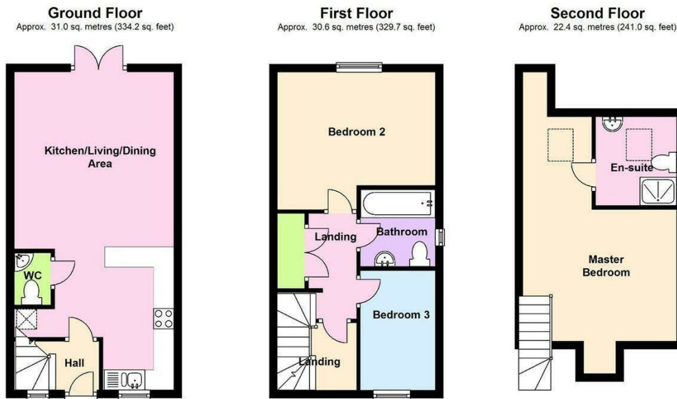
Total area: approx. 84.1 sq. metres (904.9 sq. feet) Floor plans are for illustration only and should only be used as a guide. Plan produced using PlanUp.

To view our Applicant & Tenant Fees, visit: howkinsandharrison.co.uk/applicant-and-tenant-fees