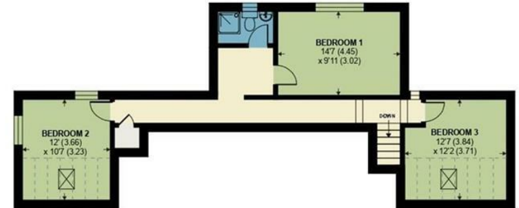
THE BARN FIRST FLOOR