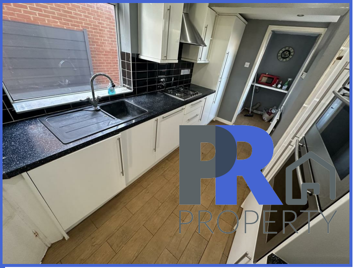
5 Barnfield Avenue, Luton, LU2 7AS £1,700