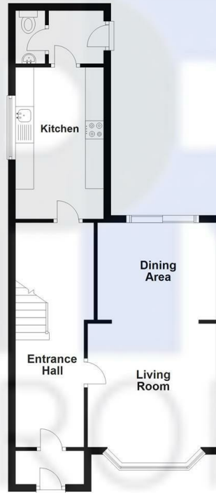
Ground Floor Approx. 50.3 sq. metres (541.3 sq. feet)