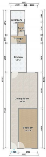
Milner Road Ground Floor