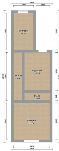
Milner Road First Floor