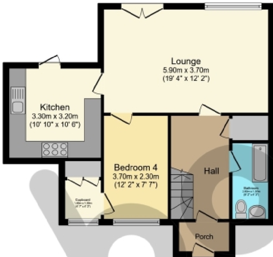
Ground Floor Floor area 60.3 sq.m. (649 sq.ft.)