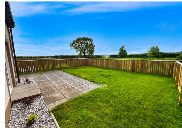
Selvieland Farm Cottages Houston Road, Houston