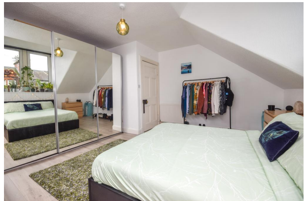
Next Home - Attic Flat, 48 Scott Street, Perth, PH1 5EH