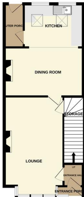
GROUND FLOOR 515 sq.ft. (47.8 sq.m.) approx.