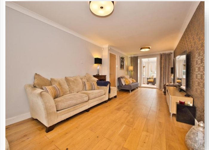
Ashwood Drive, YEOVIL, BA21 5DZ