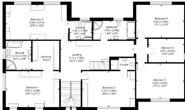
Second Floor Area: approx 70.2 m 2 ... 756 ft 2