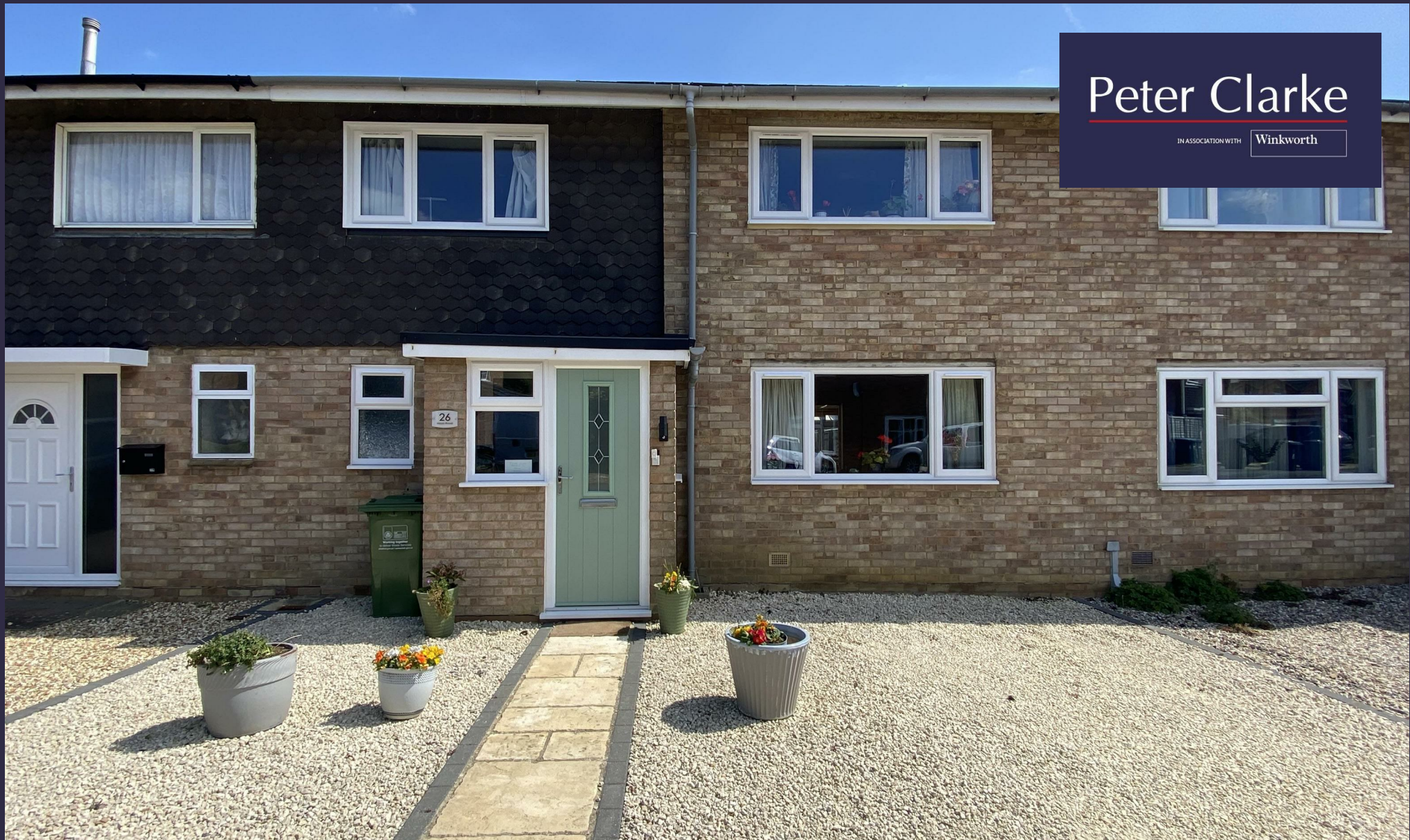
26 Mayo Road, Shipston-on-Stour, Warwickshire, CV36 4BH