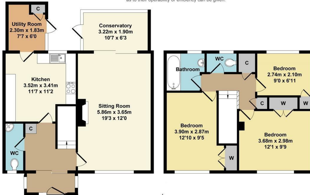
Ground Floor Approx. Floor Area 53.70 Sq.M. (578 Sq.Ft.)

Whilst every attempt has been made to ensure the accuracy of the floor plan contained here, measurements of doors, windows, rooms and any other items are approximate and no responsibility is taken for any error, omission, or mis-statement. This plan is for illustrative purposes only and should be used as such by any prospective purchaser. The services, systems and appliances shown have not been tested and no guarantee as to their operability or efficiency can be given.