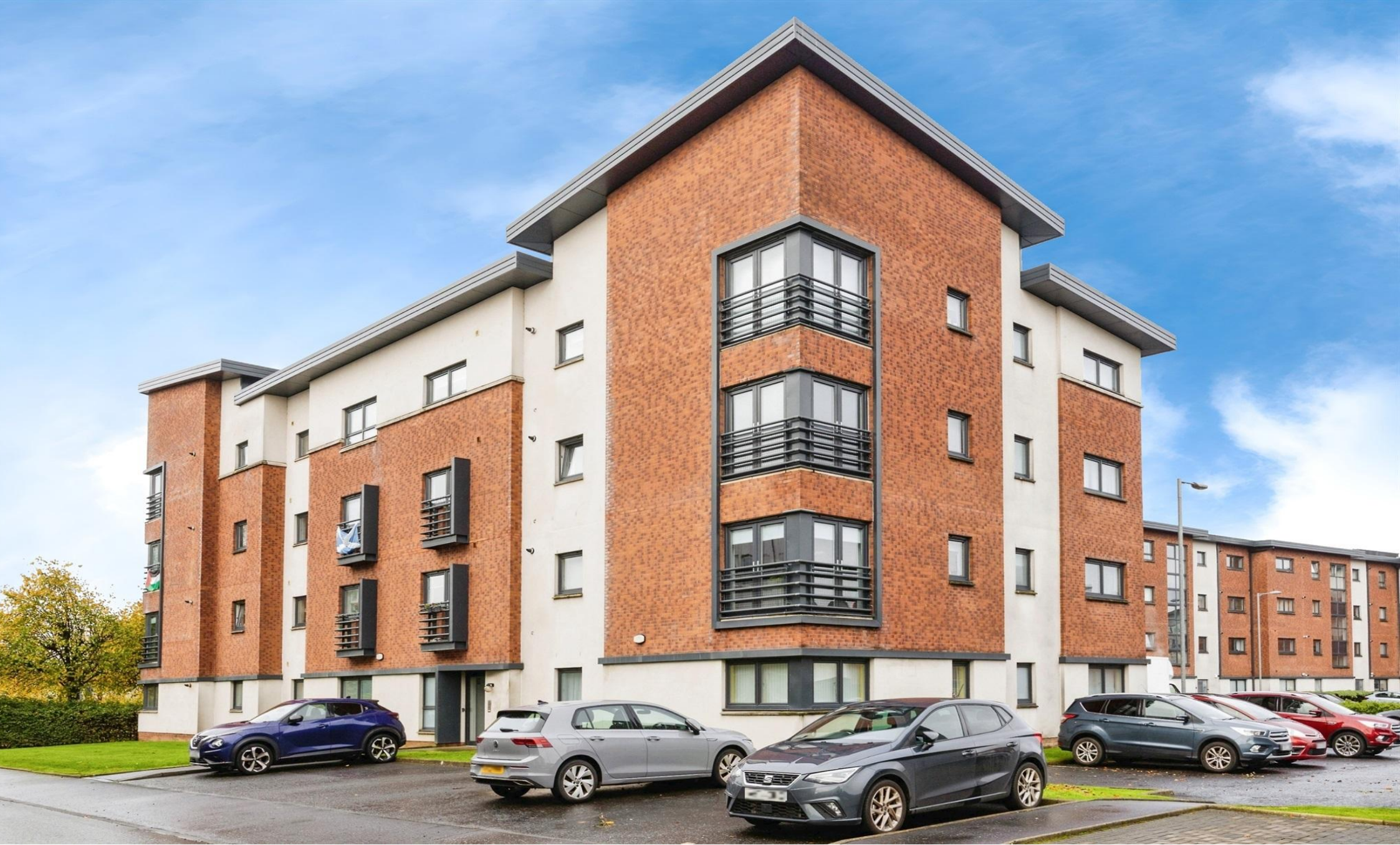
Mulberry Square, Renfrew, PA4 8AR