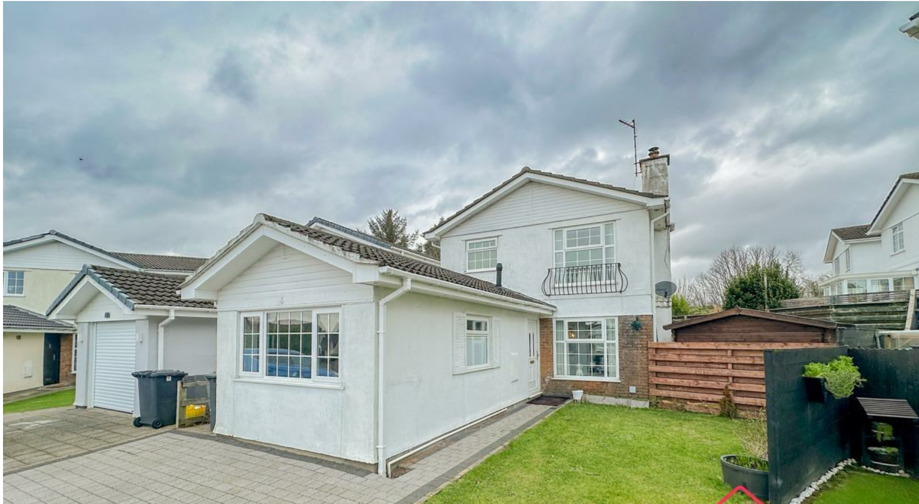
6 Larch Hill, Douglas, Isle of Man, IM2 5NQ Asking Price £449,950