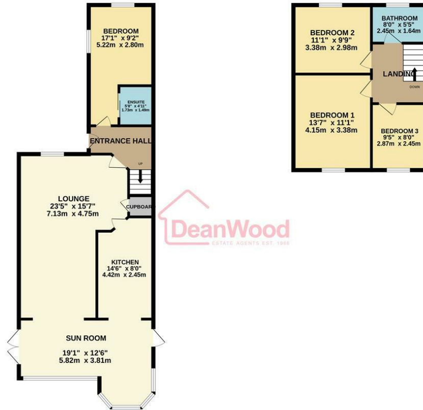
TOTAL FLOOR AREA : 1276 sq.ft. (118.5 sq.m.) approx. Not to scale for identification purposes only Made with Metropix ©2025