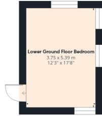
Floor -1 Building 1

Floor plan for identification purposes only, not to scale