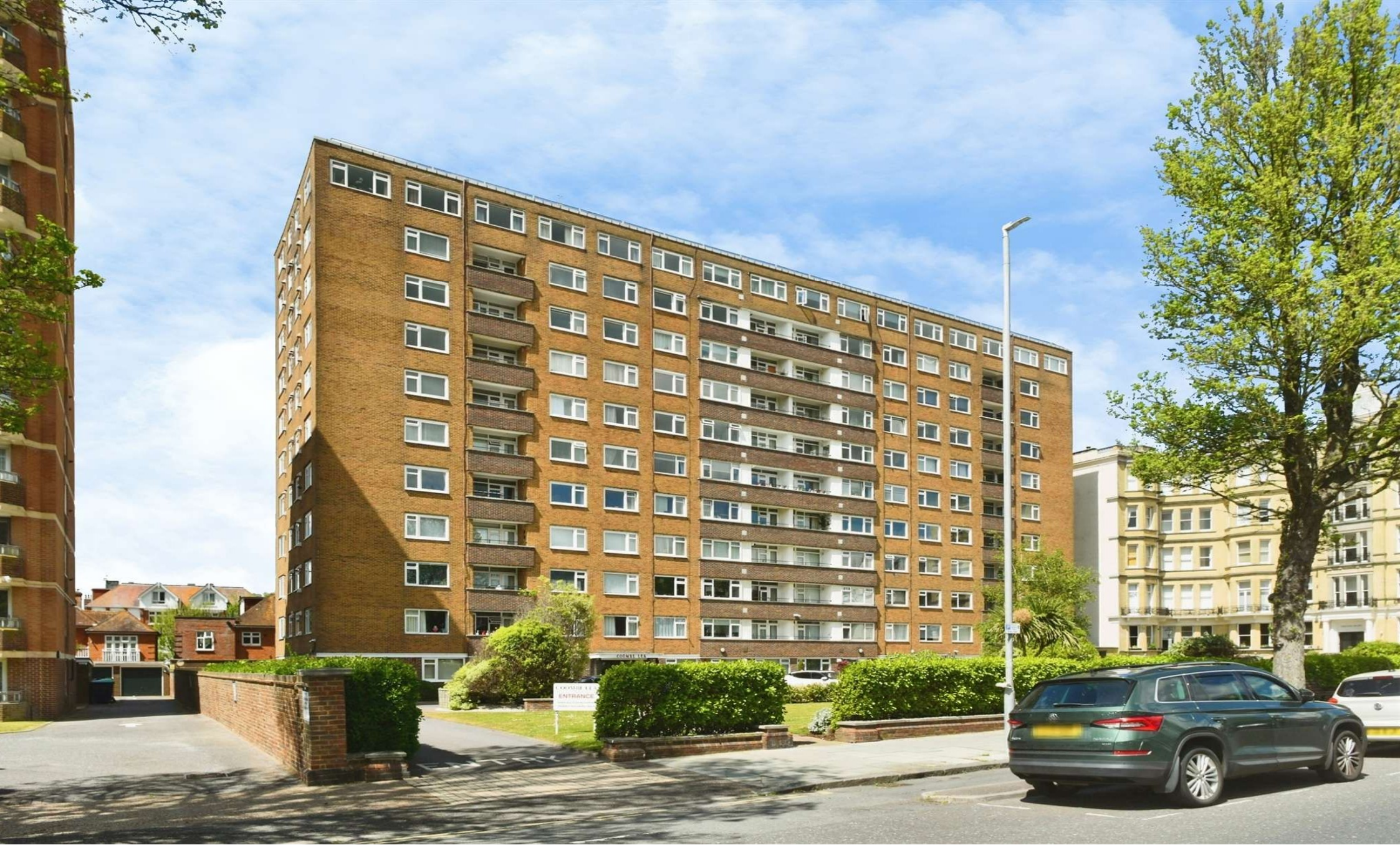
Coombe Lea, Hove BN3 2NB