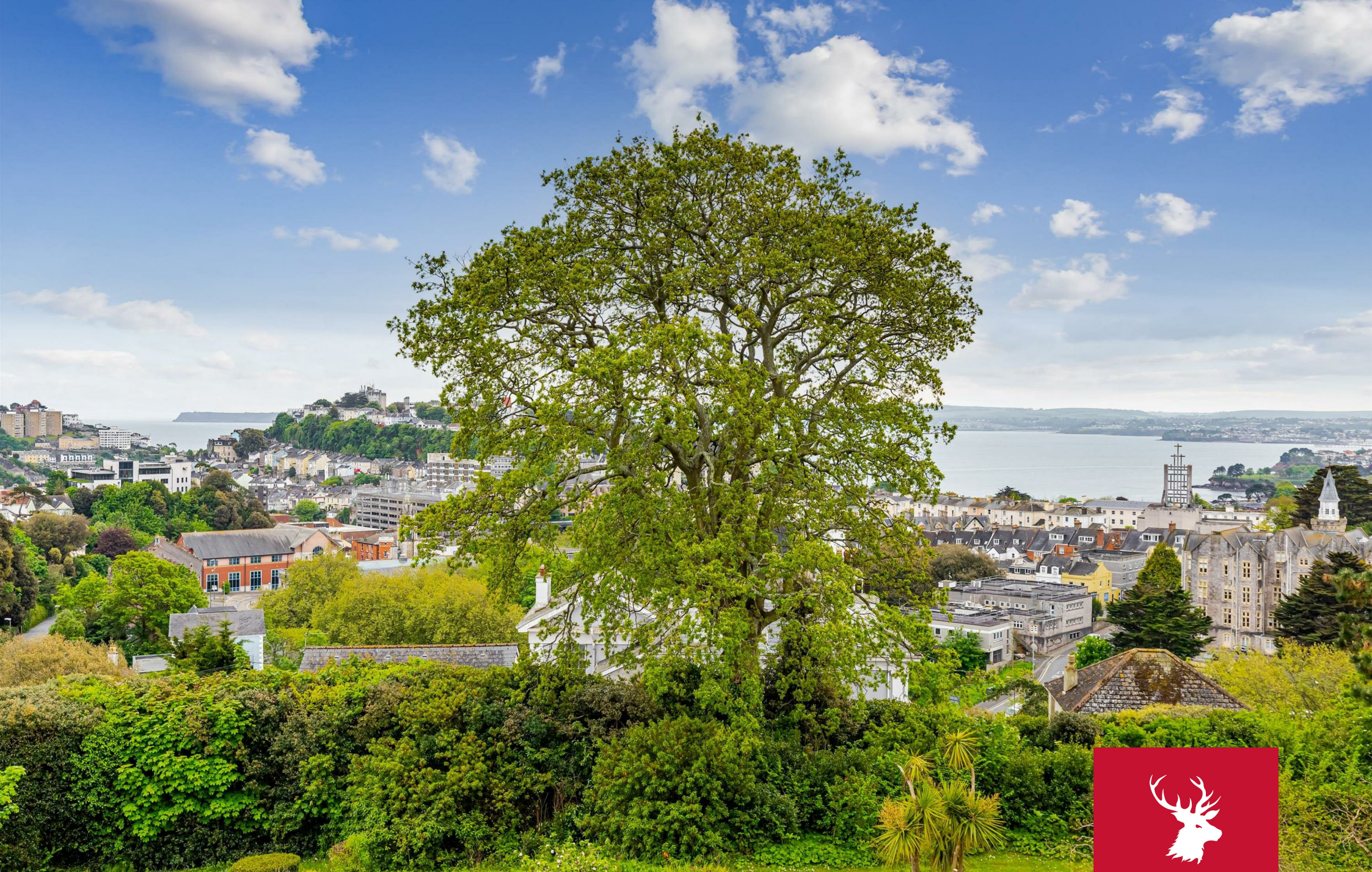
St. Ives Court Furzehill Road