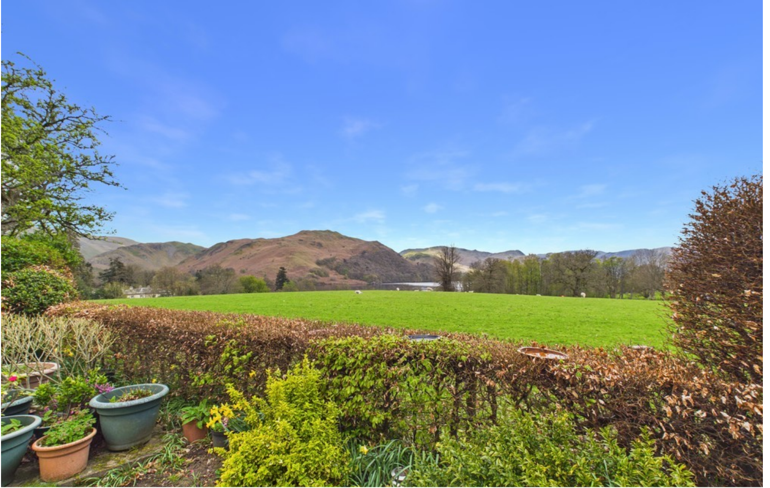
View From Rear Garden