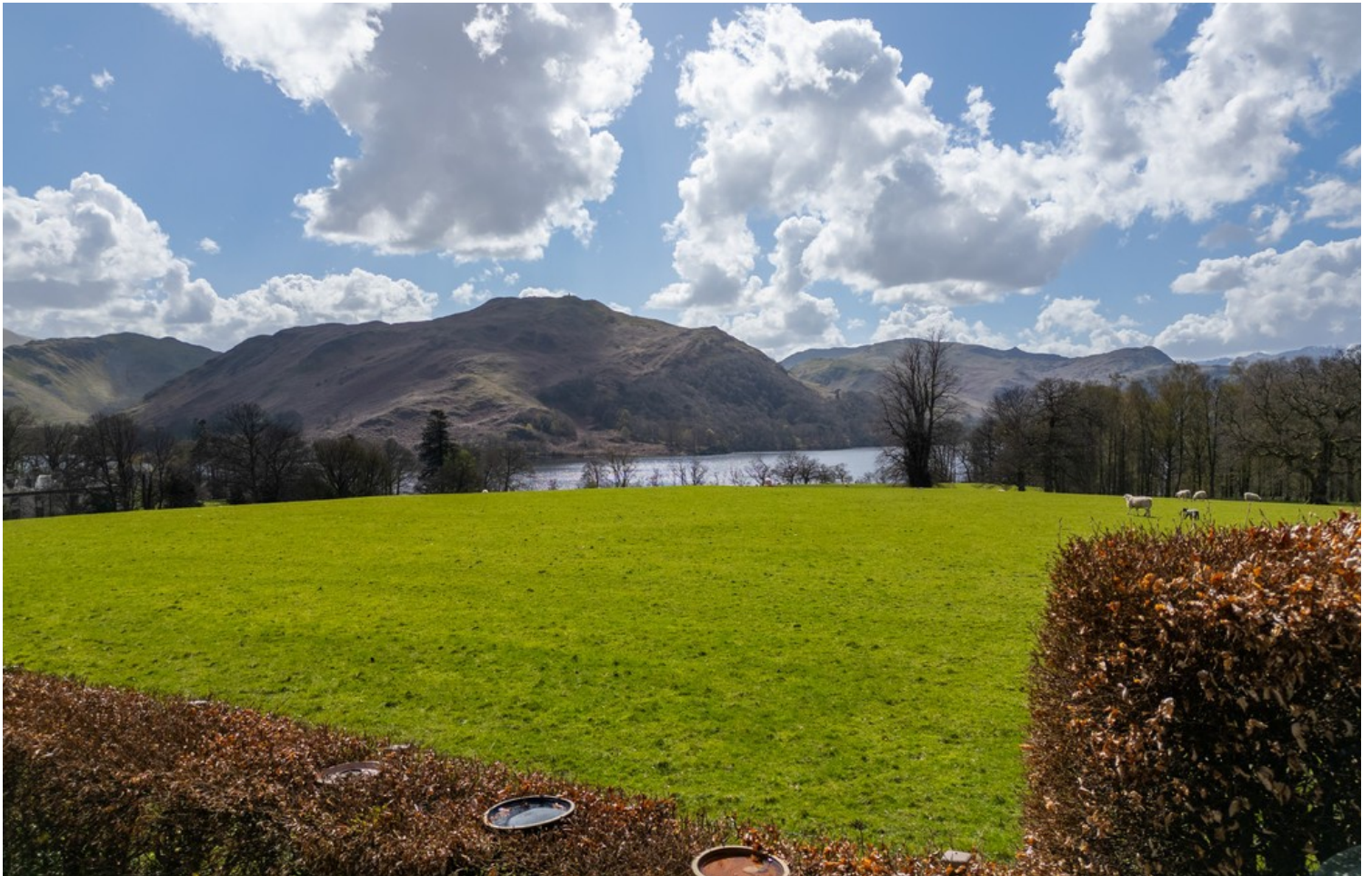
View From Rear Garden