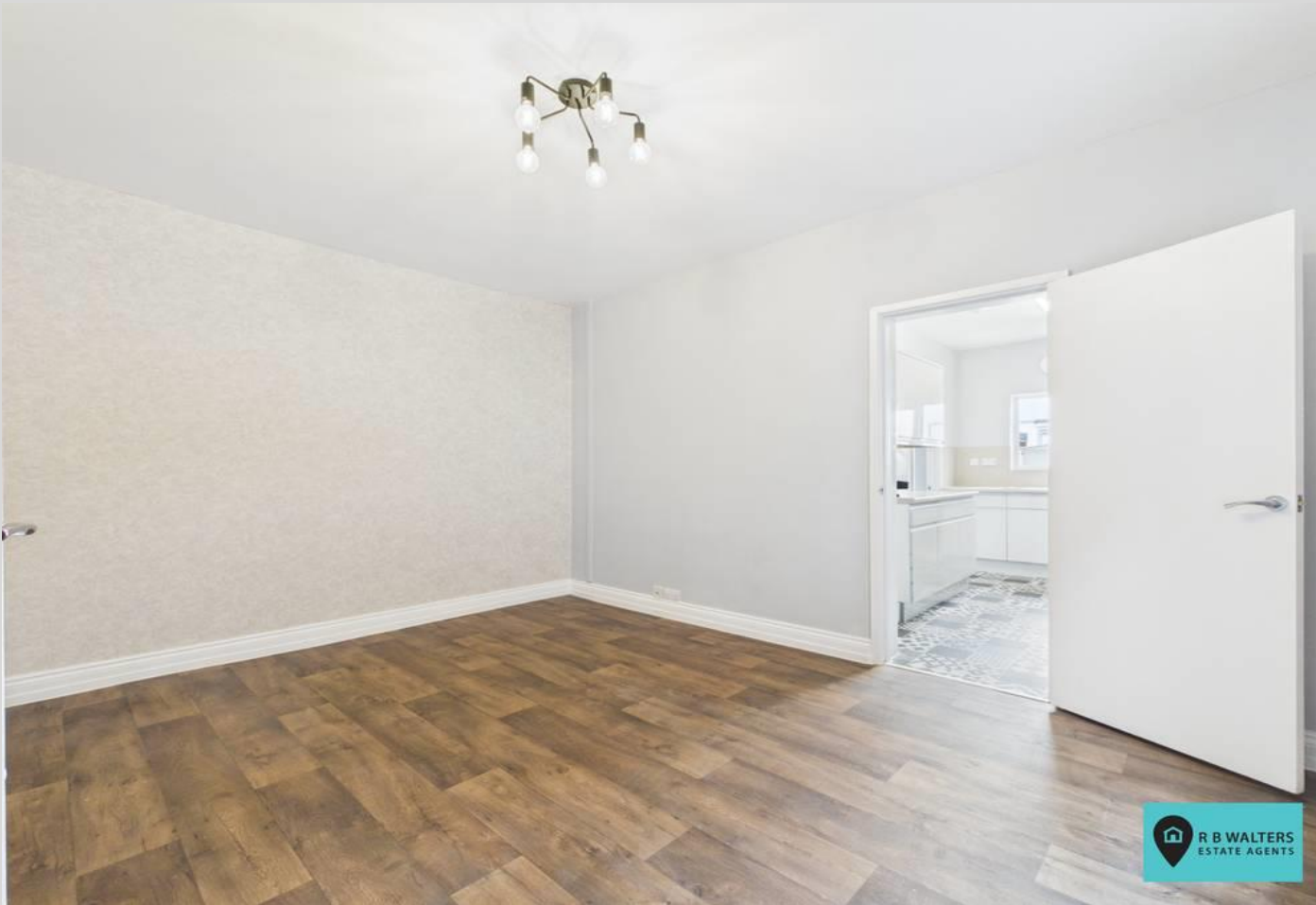
Bedroom 10' 9" x 10' 7" (3.27m x 3.22m)