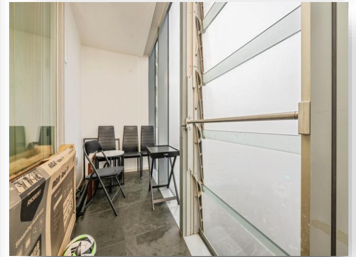
Beetham Tower Holloway Circus Queensway, Birmingham B1 1BA