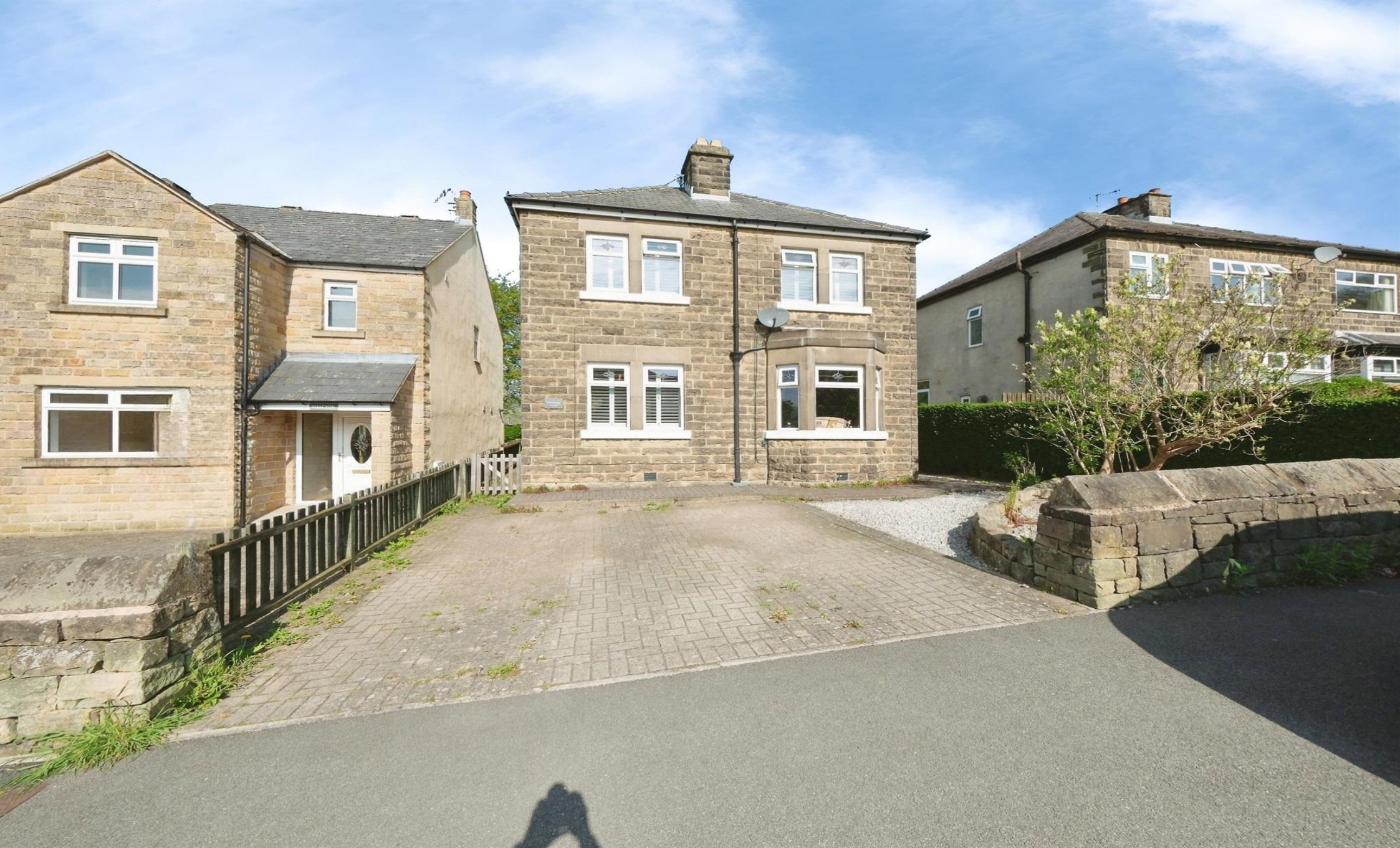
Crowstones House Crowstones Road Darley Dale Matlock