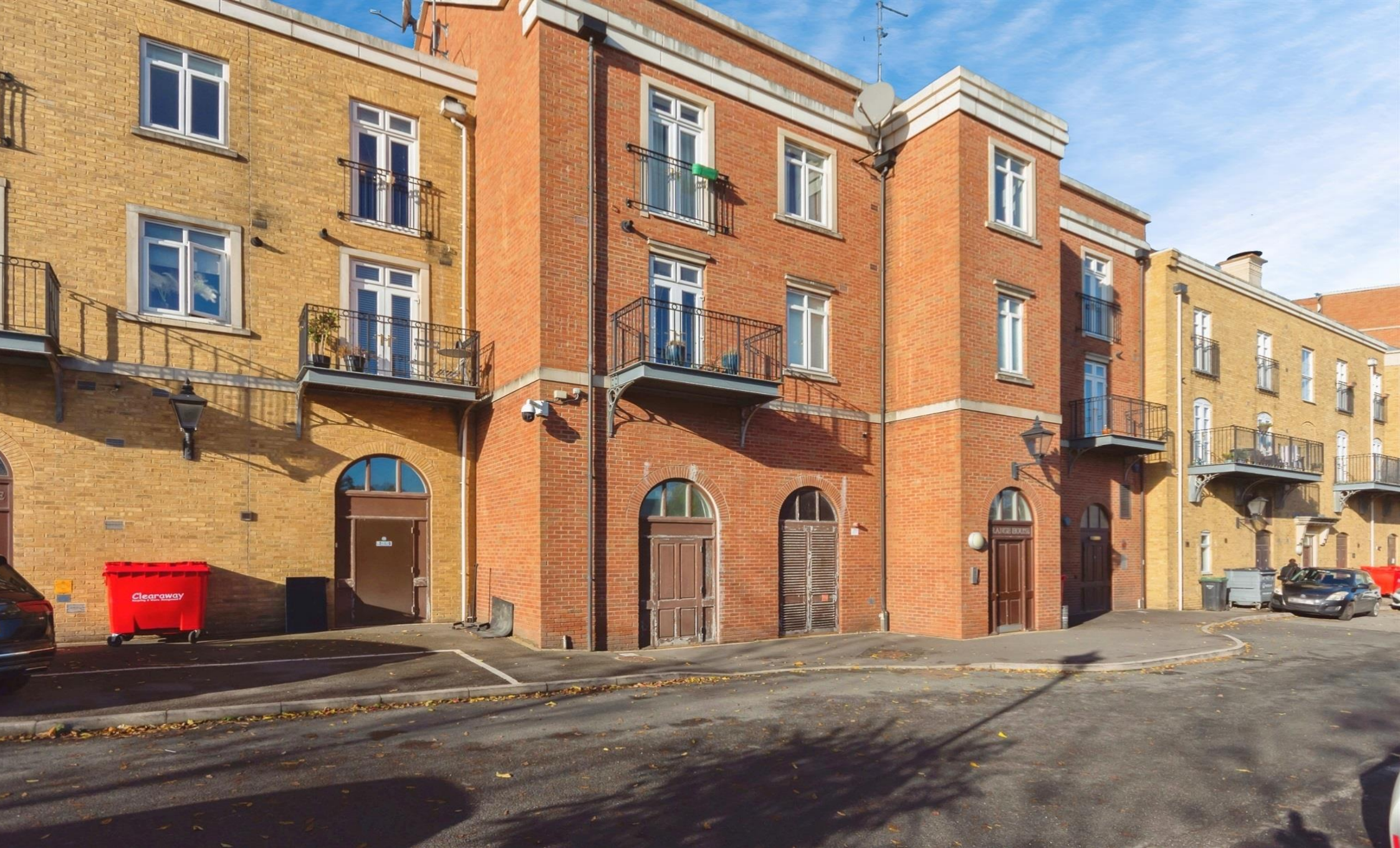
Grange House, Main Street, Shirley, Solihull